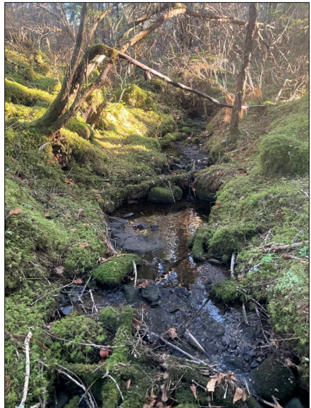
Figure 3.—Upstream view of Stream No. 111-50-10658 at waypoint 1055.