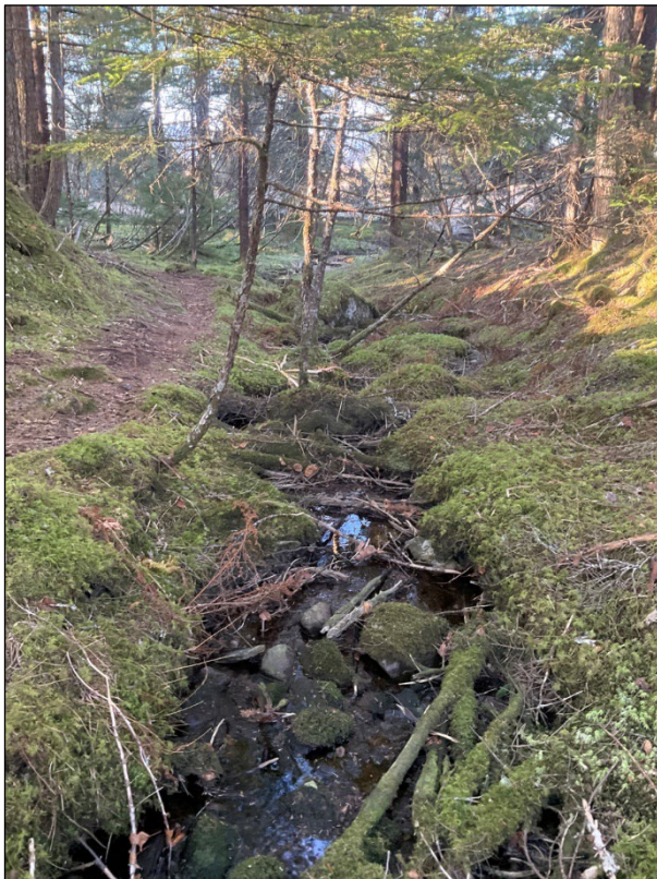
Figure 2.—Downstream view of Stream No. 111-50-10658 at waypoint 1055.