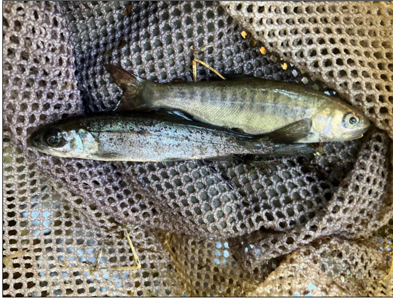
Figure 1.—Juvenile coho salmon captured at waypoint 1055.